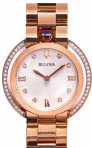
5 The Bulova Rubaiyat introduced in 2017, inspired by the original 1917 Bulova Rubaiyat watch.