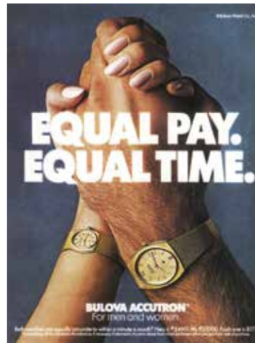
4 A 1974 Bulova Accutron print advertisement promoting equal rights