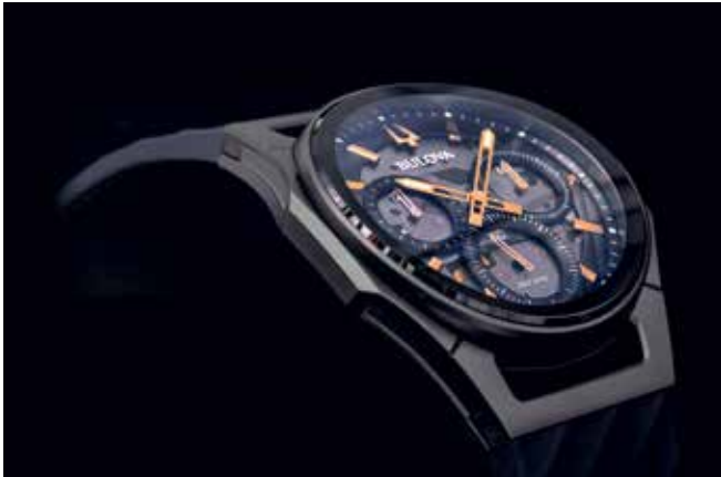
1 Introduced in 2016, the Bulova Curv is the world's first curved chronograph movement.