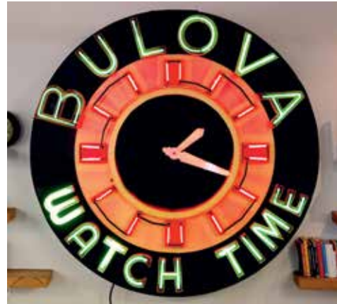
3 The Bulova clock from the 1939 World's Fair.