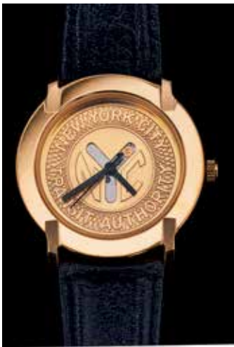
2 The Token Watch, created by Bulova in 1991, featured an embossed subway token dial and came in a box emblazoned with the endorsement, "The Official Token Watch Authorized and Licensed by the NYCTA."