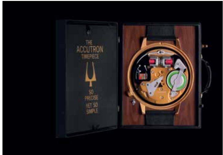
8 A 1960s Bulova Accutron sales presentation kit for retailers.