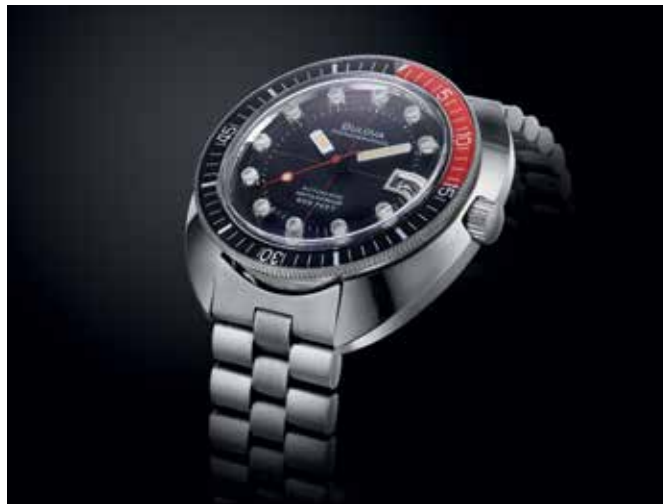
9 A 1972 Bulova Oceanographer, otherwise known as the Bulova Devil Diver.